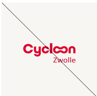
Don't add any text