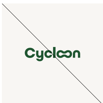
Don't use different colors