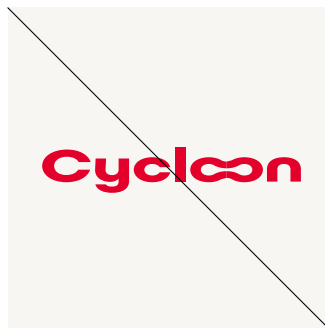
Don't change the aspect ratio