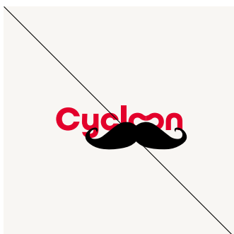
Don't add any elements