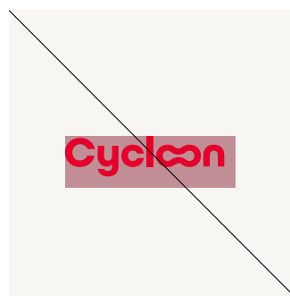
Don't add any effects